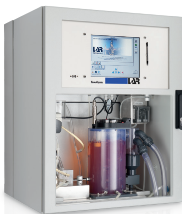
Highly sensitive bacteria in a robust analyser.

ToxAlarm continually checks drinking and surface water for pollutants. Additionally, the reaction of highly sensitive bacteria to potential toxins in water is determined. The measurements follow at intervals of less than 5 minutes.