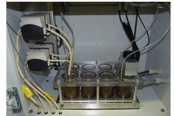
fig.2: BioMonitor inside view

All graphics and results may be printed out through the printer interface. The analyser data can be transferred to an USB stick or directly through serial interfaces. The preparation for tele-processing and remote control is optionally available.